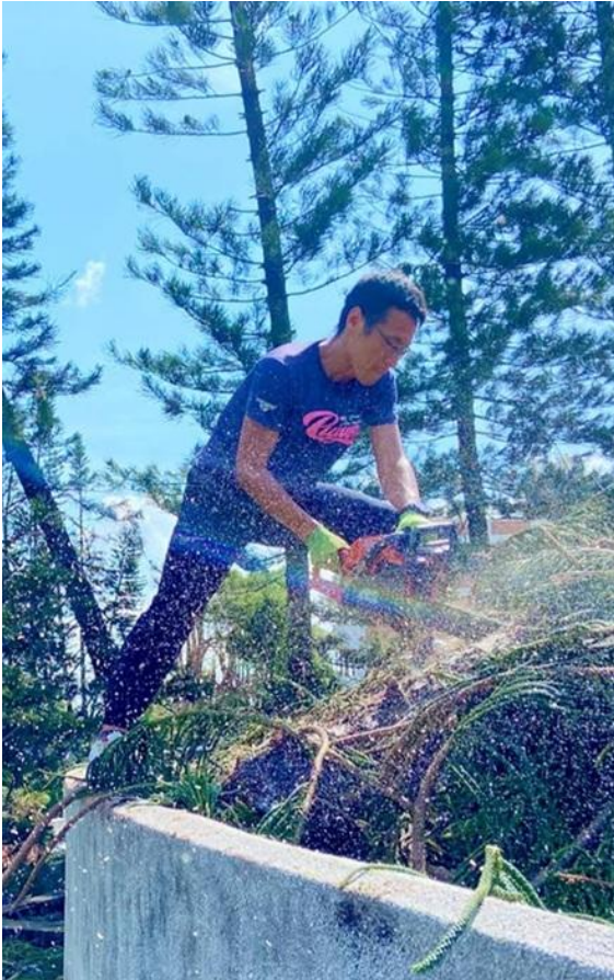
A CMS worker cuts up a fallen tree.